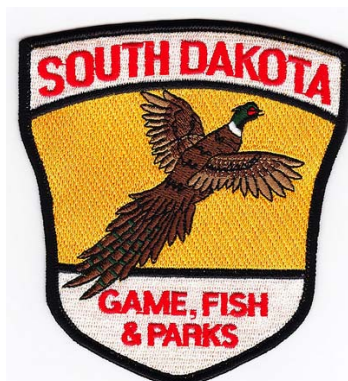
Garretson seventh and eighth graders experience nature through the Outdoor Campus, sponsored through the South Dakota Game, Fish and Parks.